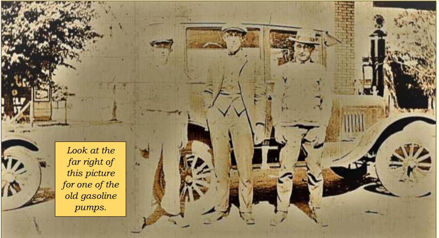
Look at the far right of this picture for one of the old gasoline pumps.