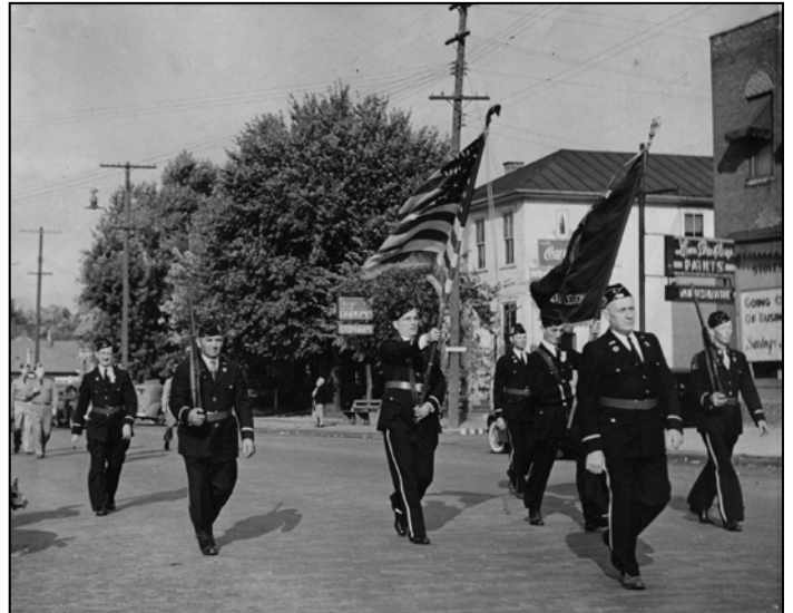
World War I veterans march in a parade in downtown Grove City in 1950.

Did you know . . . Memorial Day (Decoration Day) in the late 1860's was a time families from both the North and South remembered their Civil War dead? Veterans Day (Armistice Day) recognized the soldiers who fought and survived World War I. In the early 1900's, Memorial Day became a time families gathered at cemeteries to remember both family and military members. After World War I, Memorial Day was expanded to honor all military dead.