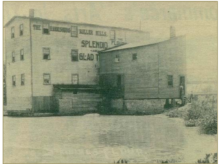
Early photo of the Harrisburg Roller Mill that appeared in the Southwest Messenger.

The mill produced two different flours. Apparently by position on the building, the primary line might have been known as Splendid but by wording on an actual photo of the flour sack, the other product line, Glad Tidings, had a slogan that it was "The Flour The Best Cooks Use"